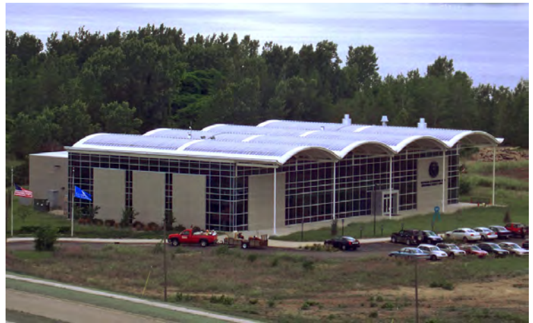
Michigan Alternative and Renewable Energy Center (30kW) Grand Valley State University, Muskegon, MI