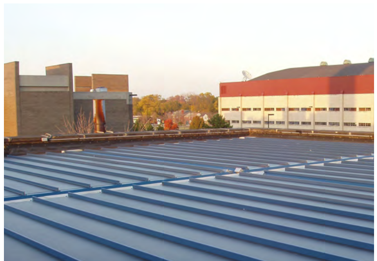
University of Detroit-Mercy (10kW) Detroit, MI

Call 1.800.528.0617 or visit us at www.uni-solar.com